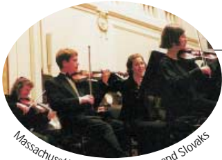
Massachusetts serenades Czechs and Slovaks

Czechs and Slovaks celebrate. Hungarians issue proceedings. Britons report on radwaste. Belgians plan conferences. French choose new chairman. 11